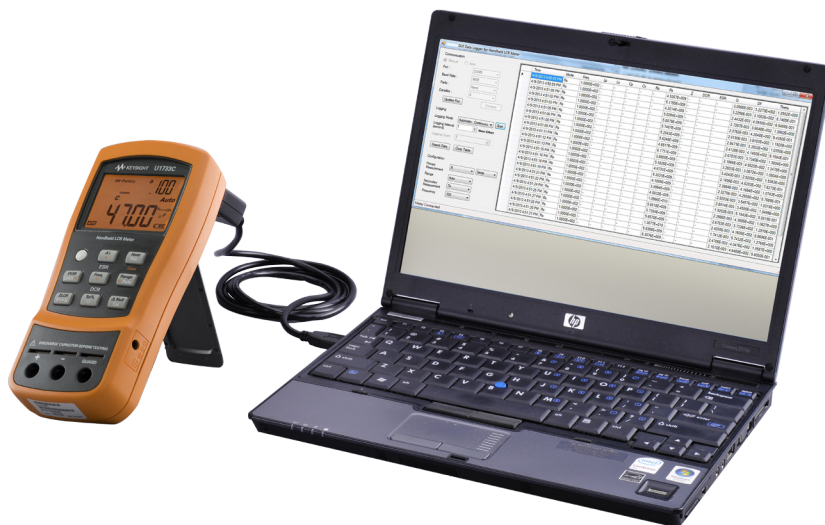
Figure 1. Automate the recording of continuous readings when you hook the U1731C/U1732C/U1733C to a PC

The handheld LCR meters allows you to test various component types, including secondary components of Dissipation Factor (D), Quality Factor (Q), and Angle Indication of Impedance ( \theta ). This new handheld series also includes other functions that result in a more detailed component analysis. For example, the built-in Equivalent Series Resistance (ESR) function helps you better understand the inherent resistance behavior typically found in capacitors across selected frequencies. DCR is a built-in DC resistance measurement that eliminates the use of a separate digital multimeter (DMM) for component test.