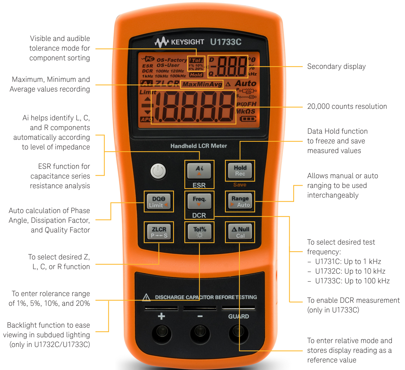
Figure 2. Front view of the U1733C